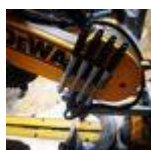
Sharpie holder by Vandelayandco