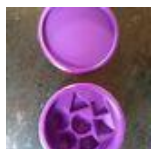
DnD Seven Dice Container with threaded lid