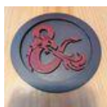
Dungeons and Dragons Logo Coaster (dnd, d&d)