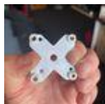
Biqu H2 EBB42 Adapter by Sout13