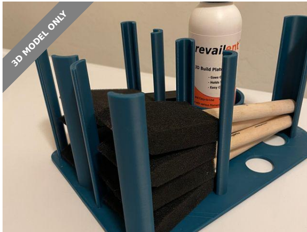
Plate Adhesive Brush and Bottle Organizer