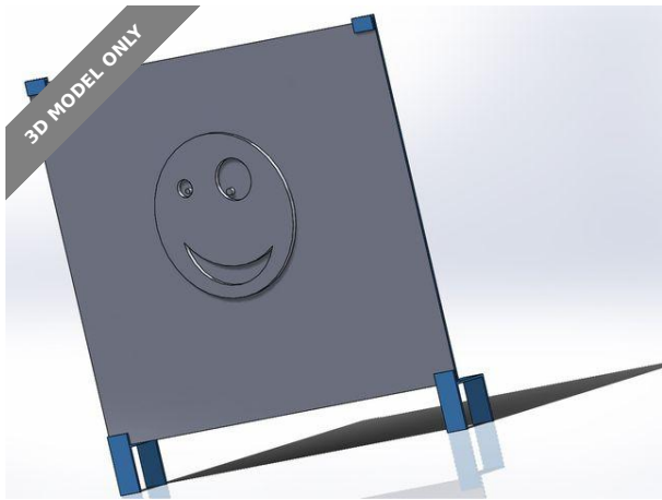
Photo or calendar card holder for office desk partition