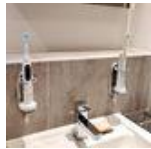
Oral B Universal charger stand by Markytuck