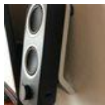
Logitech Z200 Wallmount by kaiserbene