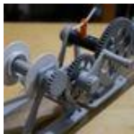
Filament Spool Winder by V3 Precision