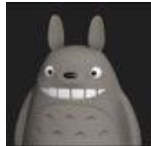
Totoro by joo