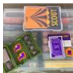
Photo Caddy Board Game Insert Collection