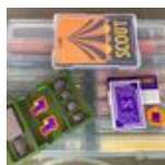
Photo Caddy Board Game Insert Collection