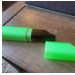
XMax v3 Pro Carry Case by 4lan9