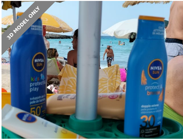
Table beach umbrella